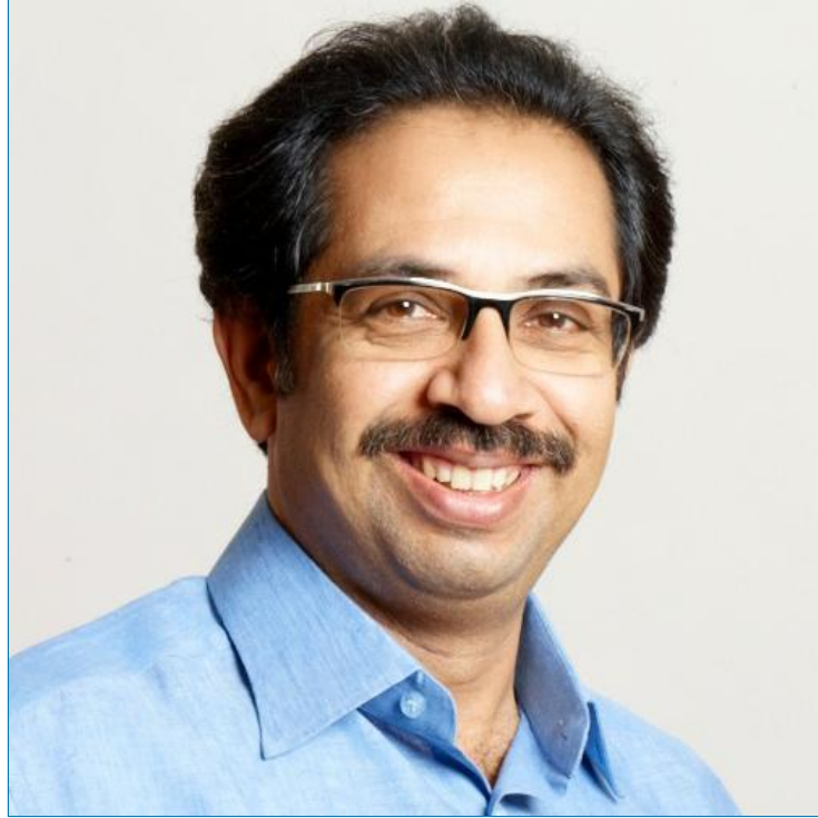
Shri. Uddhav Thackeray Hon'ble Chief Minister Maharashtra